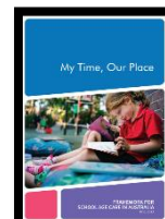
My Time, Our Place; Framework for School Age Care in Australia 2022 V2

Critical reflection: is a meaning-making process that assists informing future practice in ways that demonstrate an understanding of each child’s learning, development and wellbeing and implications for equity and social justice. It involves examining and analysing events, experiences and practices from a range of perspectives to inform future planning and decision-making ( Early Years Learning Framework 2022 V2 – refer to Sources ).